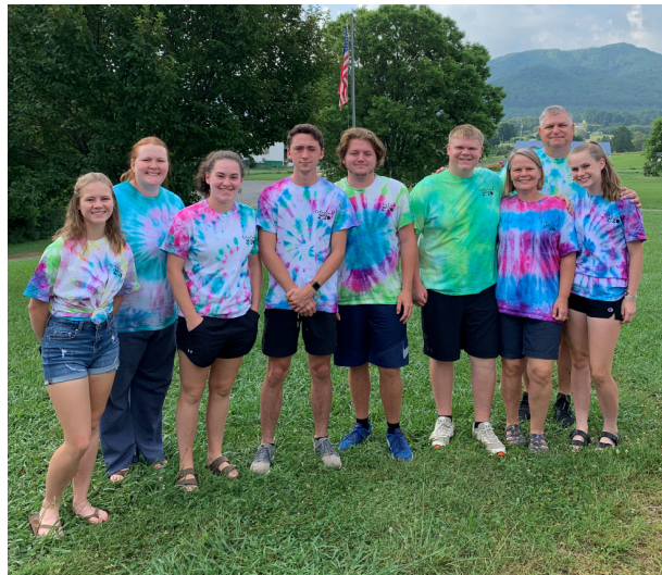
Members From Left to Right:

July 12-17, 6 youth and 3 adults traveled to Cedar Creek Mission Center. The group stayed at the Cedar Creek Presbyterian Church Mission Center near Greeneville and worked to add pickets to a retired ministers handicap ramp, replaced boards on another handicap ramp for a grandmother and her handicapped grandchild. Other projects included building a deck, removing and replacing old boards on the front of the Cedar Creek Store, pressure washing a church members home, replaced boards on a church members deck that we will replace next year, and landscaped at a historic African American cemetery. Team members also enjoyed meals, making their tie dye mission team shirts, and free time together.